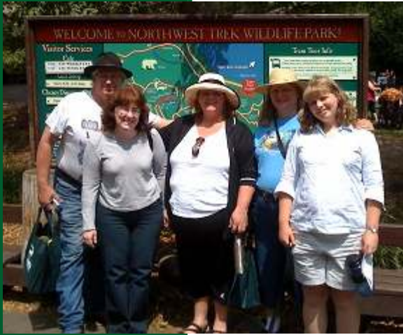
At the entrance to NWTrek Wildlife Park

On a warm Saturday morning in July, several UBC family members made a trip to the NW Trek Wildlife Park near Mt. Rainier in Eatonville. Upon arriving at the park, we made our way to see the wetlands where we were able to view the river otters, beavers and a few other cute critters in their habitat. Moving on, we had a brief discussion with one of the park staff about how the animals were cared for and that each animal was looked upon each day. We got to see Mr. Porcupine up close and were told that they do not name the animals, which we all thought was unusual. We saw a few bears, cats and birds before we took the tram around the huge wildlife park. Our group got prime seats and we were able to sit together as we viewed mountain goats, elk, bighorn sheep, moose, bison and several other larger creatures.